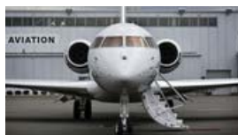
Why Private-Jet Owners Don't Want to Be Tracked