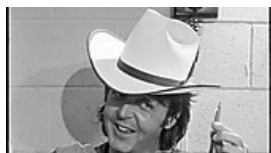
McCartney Revisits 'Maybe I'm Amazed' Live (Premiere)