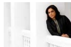
Director Mira Nair on 'The Reluctant Fundamentalist'