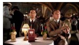
A Darker, More Ruthless Gatsby